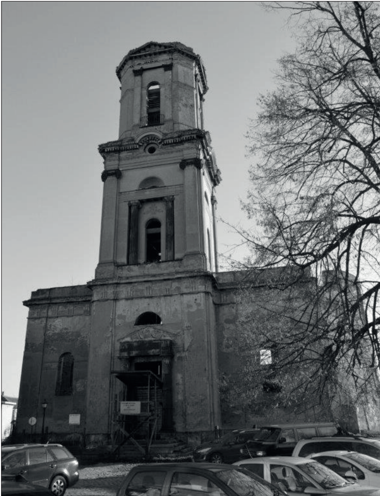
Ruin of the Evangelical Church in Szprotawa (Lubusz Voivodeship), now the property of a Polish-Catholic parish, state as of November 2018.

There were 113 churches which the Communist regime planned to dismantle in retaliation for the 1960 events in Zielona Góra (that list included the Gościkowo-Paradyż Abbey). Religious buildings, especially former Evangelical churches, as well as cemeteries and former manor complexes were among the most frequently degraded monuments. 37 It should also be noted that the status of religious architecture evolved over time. The 1970s saw the enfranchisement of church immovable properties in the Polish Western and Northern Territories pursuant to the Act of 23 June 1971