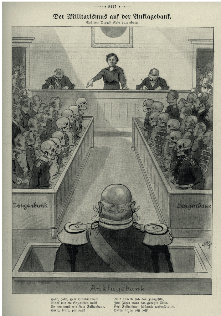
Militarism in the dock. From the trial of Rosa Luxemburg